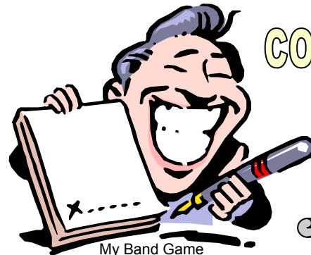
My Band Game

Your Band is signed to a limited recording agreement