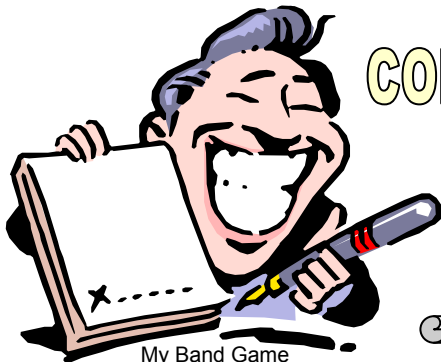
My Band Game

Your Band is signed to a limited recording agreement