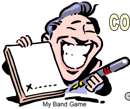
My Band Game