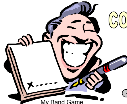
My Band Game

Your Band is signed to a limited recording agreement